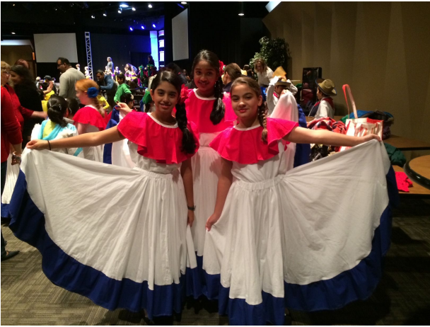
Costa Rican Dance